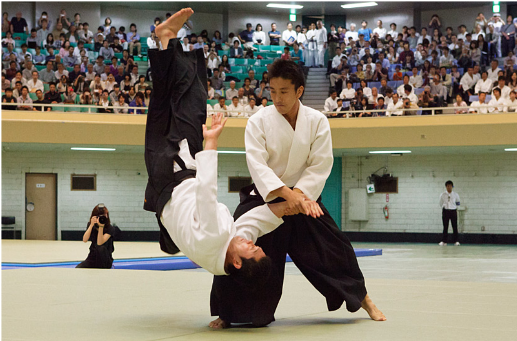
Mitsuteru Ueshiba, Aikido Ambassador.